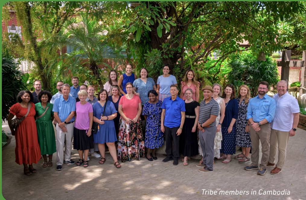
Tribe members in Cambodia

* At $25 a month, this equates to an additional $17,100 per year in support! We are grateful for the integral role that our Tribe members play in pointing others to the Great Physician!